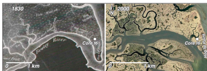
Figure 2. Comparison of the Anderson map (Anderson, 1830) with modern imagery (Google Earth™, 2010; image credit Massachusetts Office of Geographic Information Executive Office of Environmental Affairs [MassGIS EOEA] showing the location of core 16 had been mapped as marsh land in 1830.

In areas where Kirwan et al. have no radiocarbon dates, they use two different age-depth curves to calculate the age of the peat, without explaining how each curve is applied. In their analysis, they assume a priori that cores contained within the boundary of their new marsh are younger than surrounding marsh areas. This assumption biases the results, and it is problematic because a peat thickness of 300 cm could produce an age of either A.D. 1498 or 1297 B.C. (calculated using their figure DR3 from the GSA Data Repository item 2011159), and there is significant variability in peat thickness throughout the study area, even for cores that are close together. We suspect, then, that the ages assigned to the McCormick and McIntire and Morgan cores (see Fig. 1; Kirwan et al., 2011) based on age-depth relationships (and the basis for the demarcation of the “colonial marsh” area) may not be reliable.