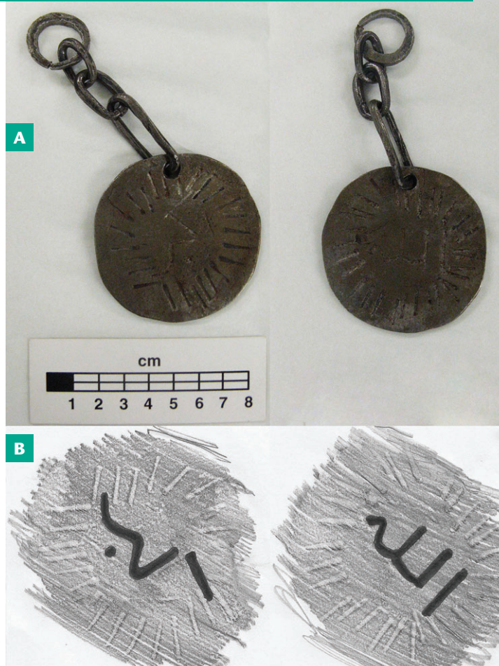
FIGURE 1 (A) The front and back of Qarabawi's Camel Charm. (B) Rubbings of the front and back of the charm, with Arabic inscription highlighted.